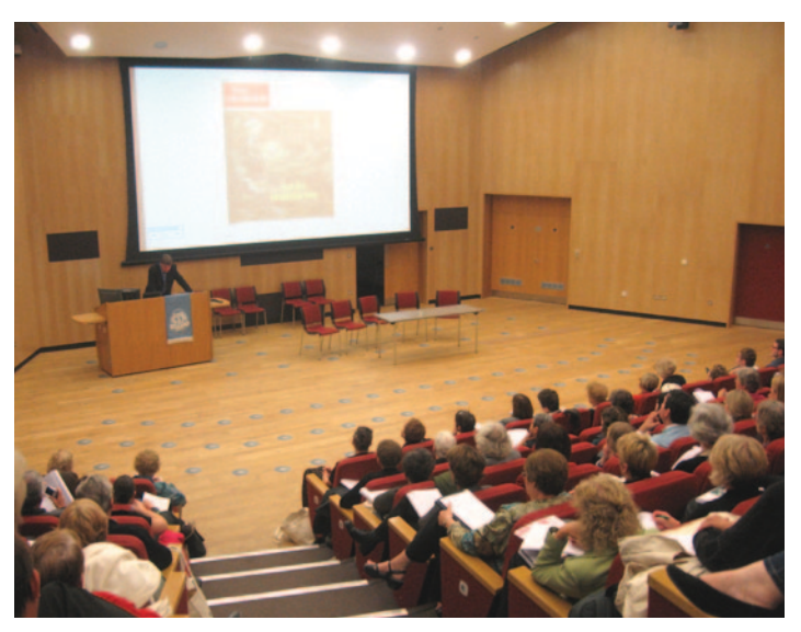
Bostridge Plenary Session