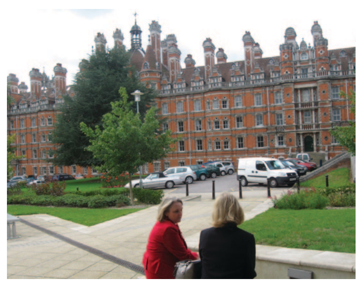
Delegates at Windsor Conference Center