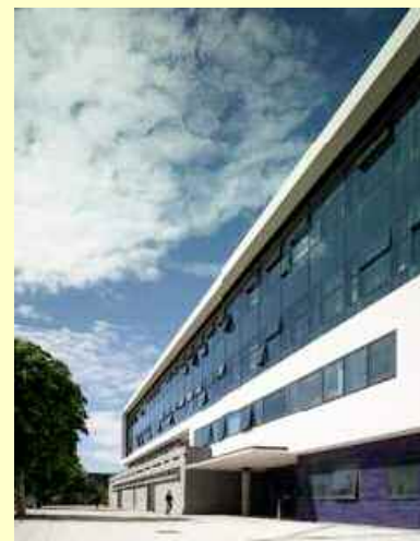
UCD School of Nursing, Midwifery & Health Systems.