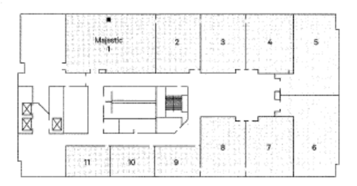
Thirty-Eighth - Hotel